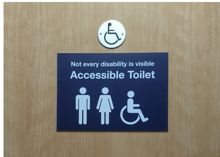
Manchester City Football Club