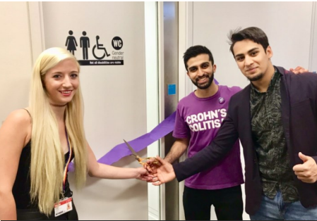
Kings College London

Schools and universities have also installed the Not Every Disability is Visible signs, supporting students and staff living with invisible conditions and raising public awareness