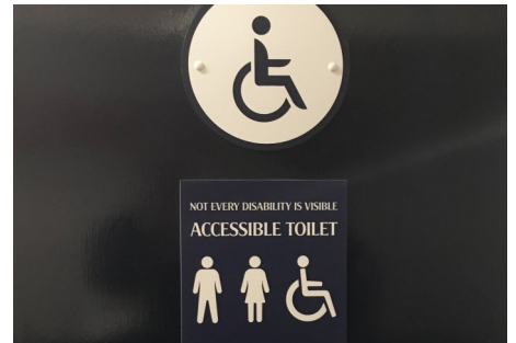
Tottenham Hotspur Football Club