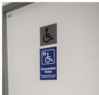
Translink Northern Ireland