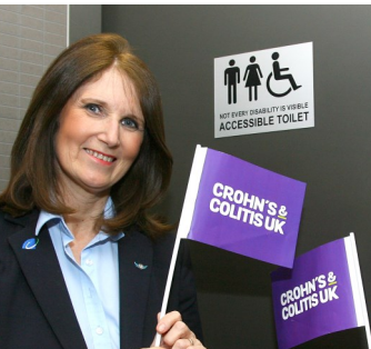
Belfast International Airport