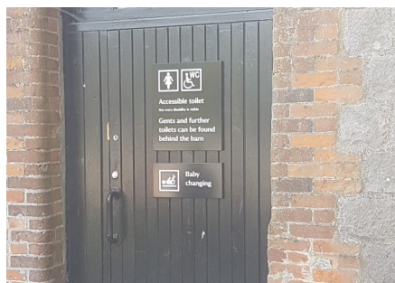
National Trust sites