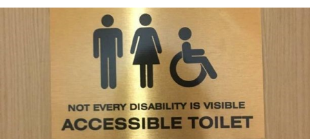
Ulster Museum, Belfast