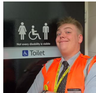
London Midland Railway stations