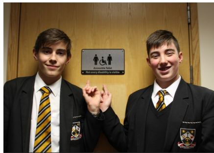
St Columba's School