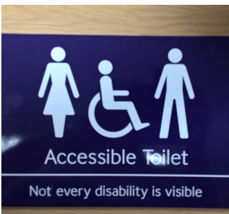
South Eastern Railway