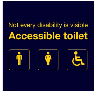
Manchester Airports Group