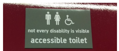
Warwick Arts Centre