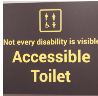
Leeds Bradford Airport