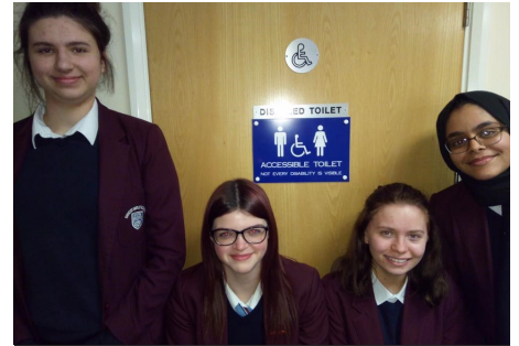
Didcot Girls School

You can also find the Not Every Disability is Visible sign being used in major sports, cultural and recreation centres