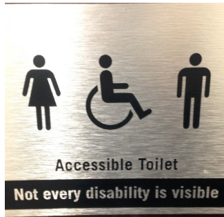
London City Airport