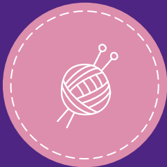
Sell handmade crafts • £150