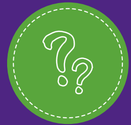
Quiz night • £200