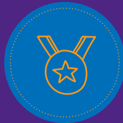
Host a competition • £100