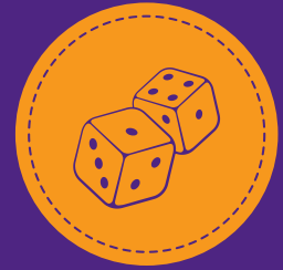
Games night • £150