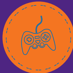
Gaming competition • £150