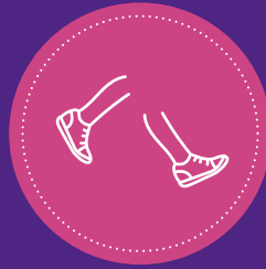
Sponsored walk • £200