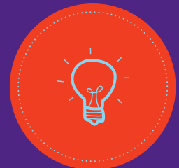
Do your own thing!

Improved lives today, and a world free from Crohn's and Colitis tomorrow