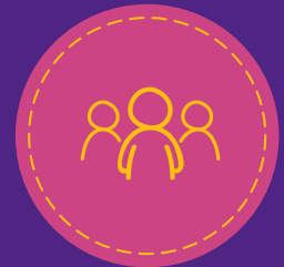
Have a get together • £100