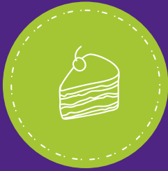
Cake sale • £150

Ready to get fundraising and have a target in mind? Why not set out a plan to break it down into manageable chunks. To help, we've suggested how much we think you could raise from each idea!