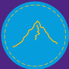
Sponsored climb • £250